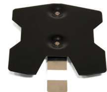
SMRT charger mounting bracket