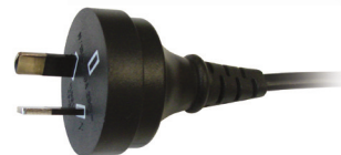
240V AC - Australia (AS-3112 without ground pin)