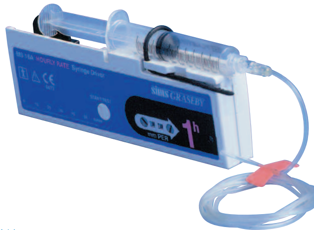
MS16A Syringe Driver rate set in mm/hr