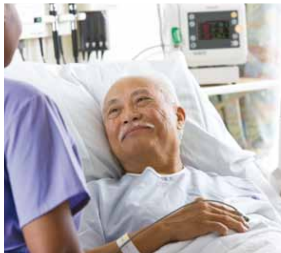
Philips reusable cuffs include Easy Care, Traditional, and Comfort.

Quality reusable Comfort cuffs provide a practical alternative to traditional multi-patient cuffs and are a good choice for busy clinical units that use cuffs frequently. The cuffs feature soft material for outstanding patient comfort, while offering the economic benefits of multi-patient use with an easy-to-clean, waterproof design that resists stains and odors.