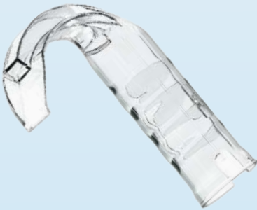
Medium Adult Size 3 Part Number: YLO-III B3