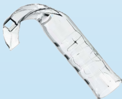
Large Adult Size 4 Part Number: YLO-IIIB4