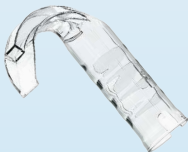
Medium Adult Size 3 Part Number: YLO-IIIB3