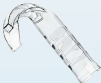
Pediatric Size 2 Part Number: YLO-IIIB2