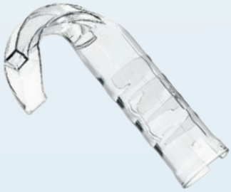
Pediatric Size 2 Part Number: YLO-III B2