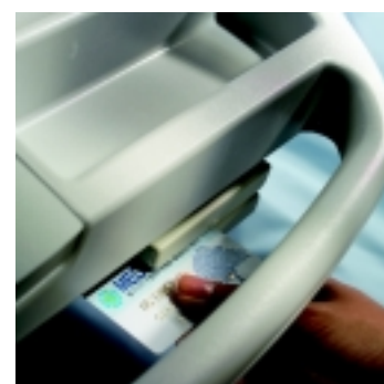
Barcode and magnetic card reading options