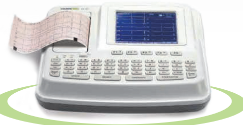
SE-601B 100 ECGs Internal Memory (5.7 inch single color LCD display)