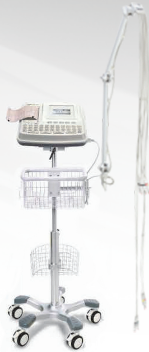
SE-601A 50 ECGs Internal Memory (3.5 inch single color LCD display)