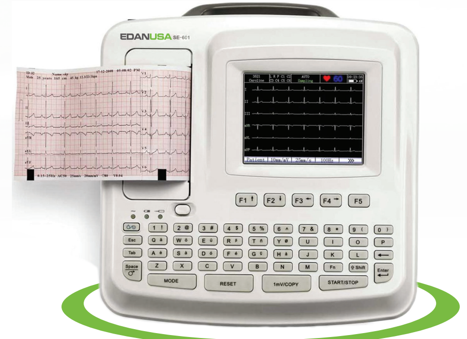
SE-601C 200 ECGs Internal Memory (5.7 inch multi-color LCD display)