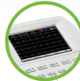
Large Color Screen