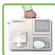
Portable Design (Handle Optional)