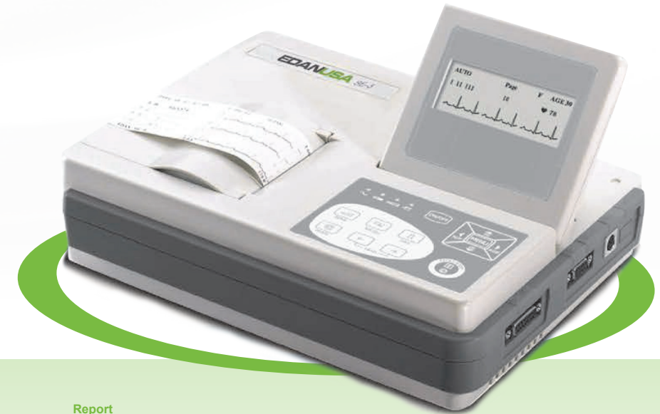
SE-3 (Narrow Screen)