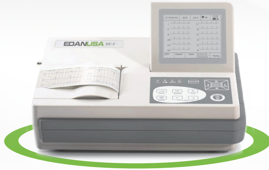
SE-3 (Wide Screen)