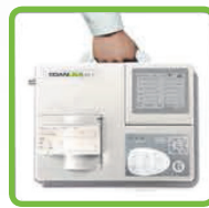
Portable Design (Handle Optional)