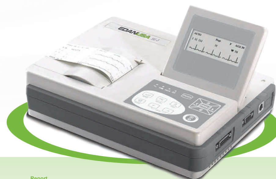
SE-3 (Narrow Screen)