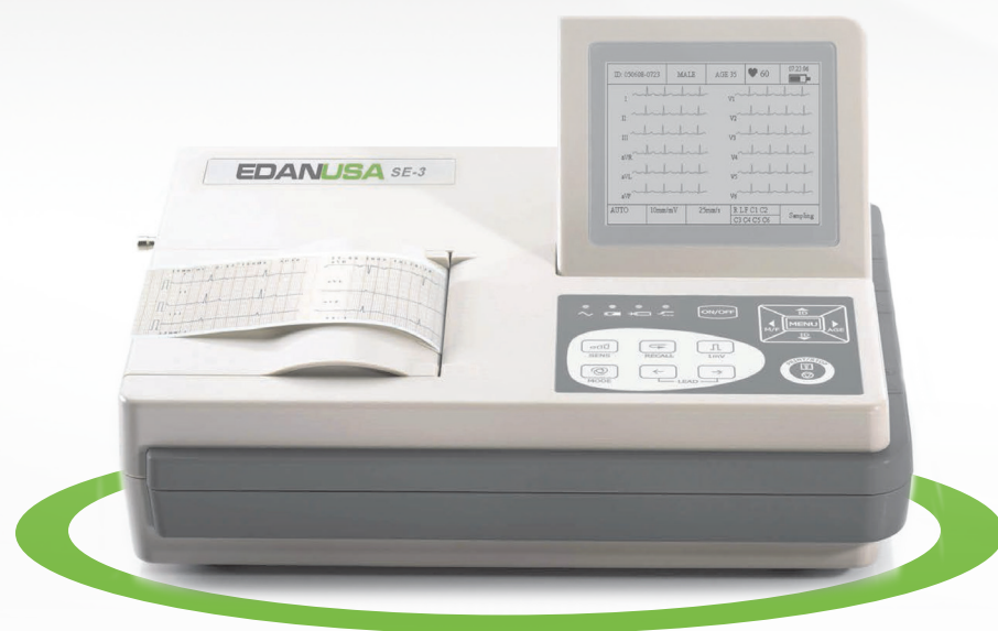
SE-3 (Wide Screen)